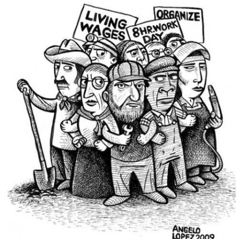
ANGELO LOPEZ 2009