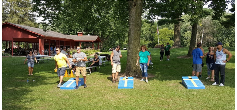
2017 union picnic

This year's event will be FREE for all active and retired members to attend.